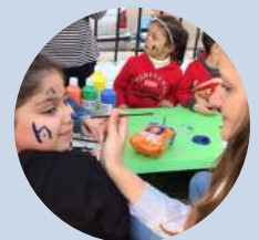
Art & Craft and face painting activities in Al Mina's Safe