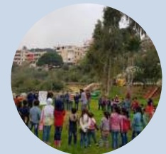
Recreational activities in Chhimme's Safe Park