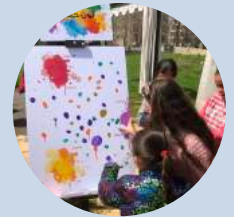
Children coloring their rights in Aley's Safe Park

In partnership with UNICEF, Service Social International and Madad EU trust, himaya launched a new Safe Park for children in Tripoli El Mina. Members of the municipality, UNICEF representatives, other NGO, and the local community attended the opening ceremony supporting our new project. To celebrate our new achievement, children and parents were invited to take part in fun activities inside their new Safe Space!