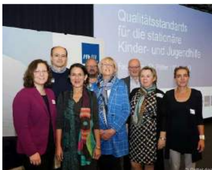
Regional round tables/events: Quality Standards for professional Out-of Home Care of Children and Youth