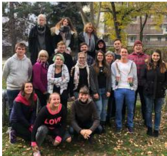
Care Leaver meeting as part of the Leaving Care Project

Additionally, the young people took part in a Media-Workshop and created poems and took photos to reflect their situation and demands, which were exhibited in the House of the European Union and shown to the politicians and participants during conference.