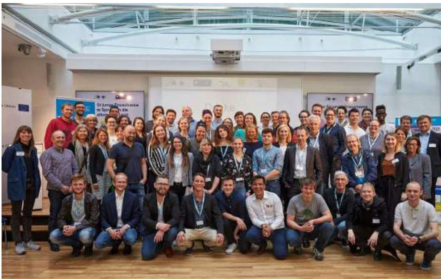
Conference, part of the CareLeaving Dialog project